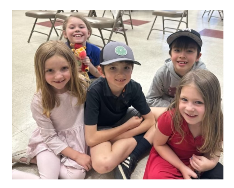
The Lighthouse Kids enjoyed a delicious spaghetti supper Wednesday night.

Do you want to be more involved with the Lighthouse Kids? We are in need of volunteer Sunday school teachers and volunteers for Wednesday nights! Please let the church office know if you would be willing to serve in this area. Our kids are our future!