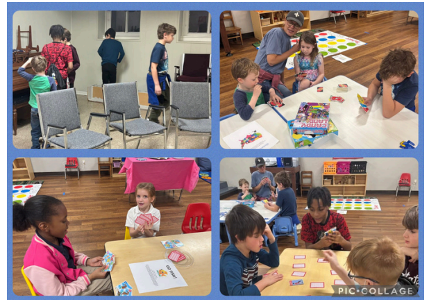
Fun at Game Night