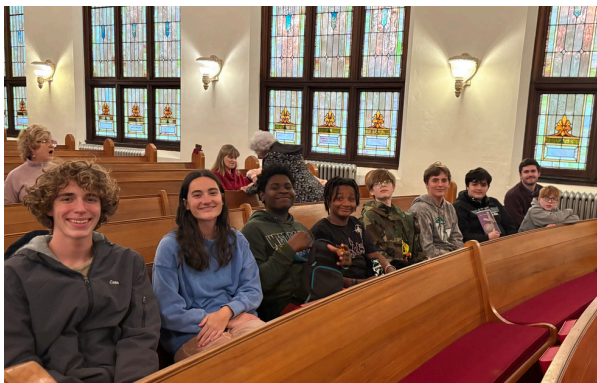
The Youth at the Ash Wednesday Service

We were extremely blessed during the Ash Wednesday Service. One member stated that it was the most meaningful one that she could remember. Several of the youth were there, and for several it was the first Ash Wednesday Service they had attended.