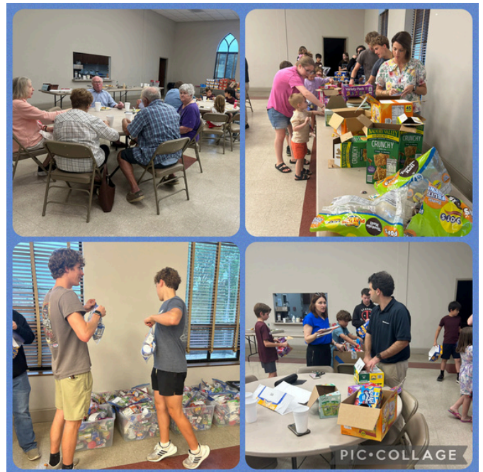
A Busy Wednesday Night

This week in Sunday school the children learned about Jesus teaching his disciples and others the Lord's Prayer. They used picture cards to practice learning the prayer. Then they built their own personal toolbox full of tools, each one representing a way that prayer is a tool for us to communicate with God.