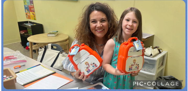
The Toolbox of Prayer

Prayer is a powerful tool that God has given us to communicate with Him. Jesus even taught us a special prayer, the Lord's Prayer, so that our communication with God would be most effective.