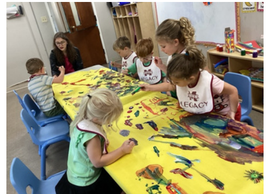
The children in the CDC are having so much fun finger painting.